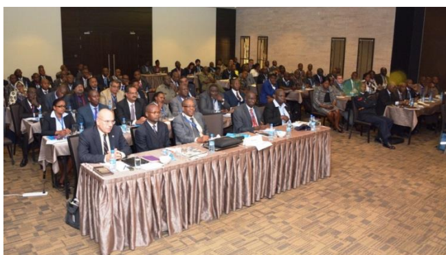
Seminar in progress at Amber Hotel, Nairobi

The International Police Association Counter-Terrorism Seminar, organised by IPA Kenya, gathered international counter-terrorism security experts and other security stakeholders from the region and beyond, to share, learn and discover ways of detecting, identifying, preventing and all together stopping these acts of insecurity and terrorism in the region.